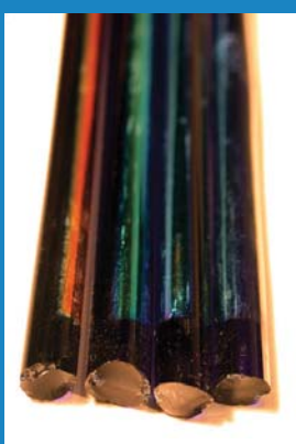
Dichro transmits various colors

Questions? Call Toll Free 1-866-684-6986 or visit us on the web at www.northstarglass.com